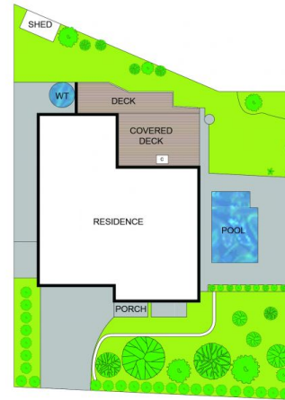
SITEPLAN (NOT TO SCALE)